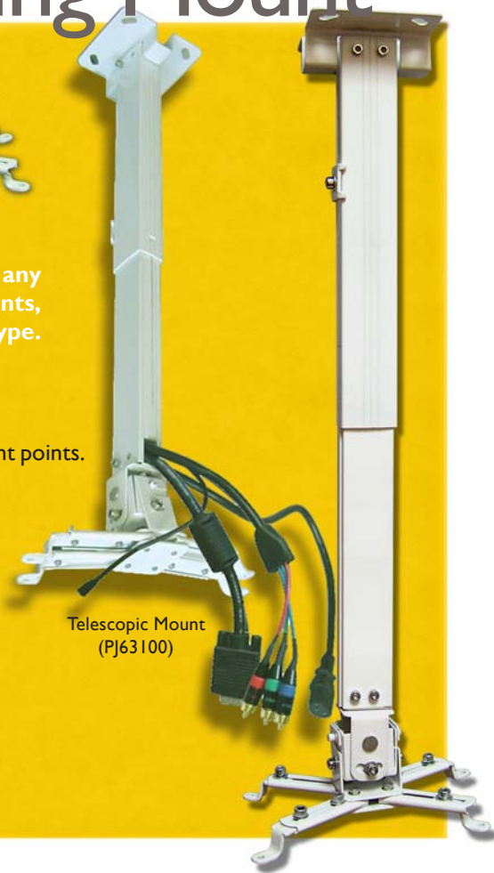
Telescopic Mount (PJ63100)